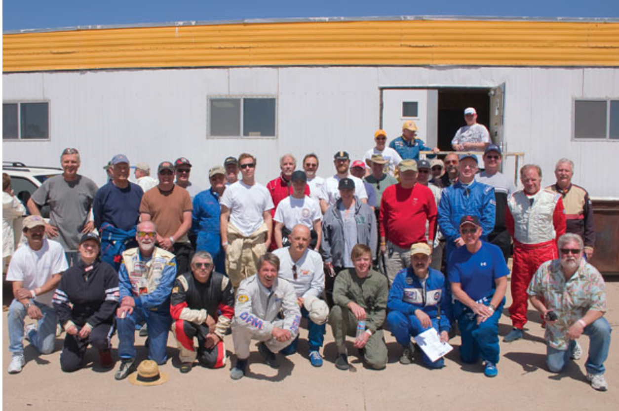
RMVR Class of 2008