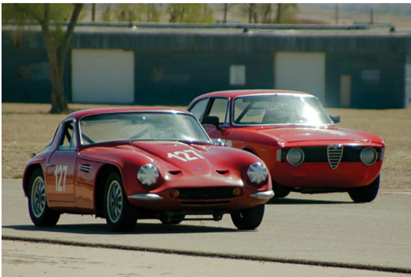
#127 Ian Rainford - 1967 TVR Mk 4 1800S & #48 Jay Huitt - 1967 Alfa Romeo GTV

Saturday brought out the rest of the drivers and their fine collection of racing machines. There were around 80 participants in four race groups for the club races. It was evident that these men and women didn't sit around all winter while their cars froze in the garage. The cars were all well