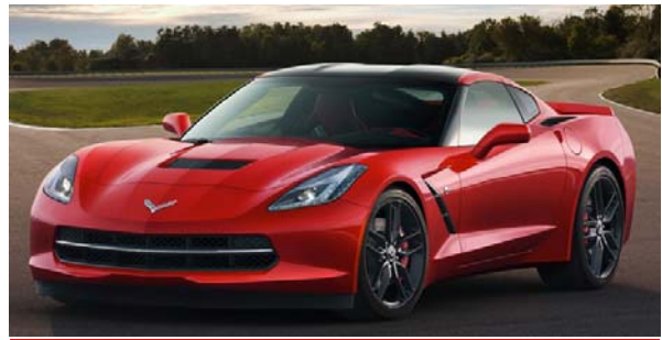
If it were a sports car, it would look like this!

Just imagine how much great research we can enable together!