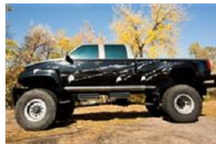
If Available - may be substituted

This will be no ordinary ride, though. It will be fully stocked with snacks, drinks and treats including provisions for an early start to the Saturday evening happy hour! While everyone else will have to wait to get to the paddock, you will be able to start your party as soon as you’re picked up. There may even be some other surprises to be found – but only the top worker fundraisers will know for sure.