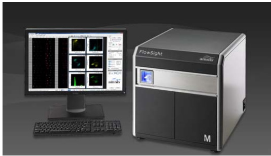
This is it! Here's what we're trying to fund with the Race Against Kids' Cancer.

We are once again excited about the prospect of making a significant impact on the Morgan Adams Foundation (MAF), a great organization dedicated to pediatric cancer research. Over the past three years we've raised over $225,000 for MAF and with everyone's help, we can add to this total! This year our goal is to raise $87,000 for the purchase, installation, and service of a Flow Cytometer, a very special piece of analytical equipment which allows physicians & researchers to better understand, diagnose, and treat tumors more effectively. By participating in the Race Against Kids' Cancer race weekend, you are directly impacting and improving the lives of children with cancer.